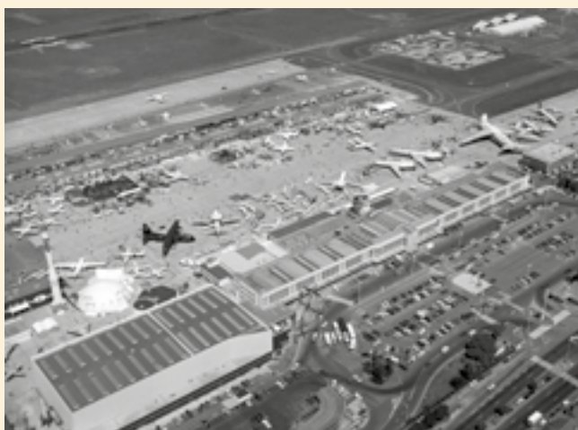
Aerial view of 1979 Paris Air show

For the future editions, "Bourget Aéroport" metro stop on line 17 of Grand Paris Express will reinforce the relationship between the two institutions, where visitors will arrive directly at the museum entrance when they exit the metro.