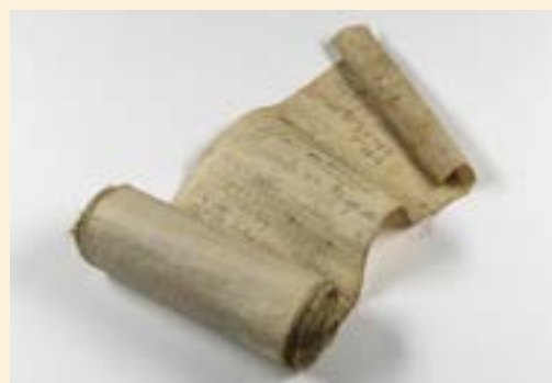
Roule-notes from the Point d'interrogation flight in 1930 by Maurice Bellonte and Dieudonné Costes