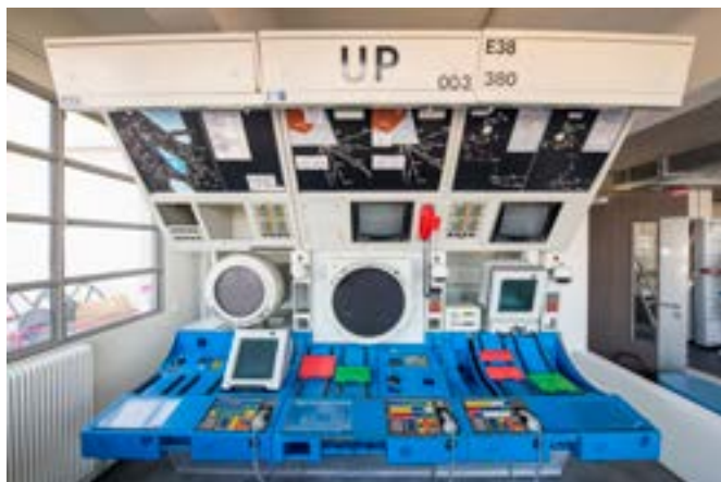
CAUTRA console , essential tool for air traffic controllers

Inside the area where air traffic services were hosted until 2017, the historical control tower of Le Bourget airport now unveils the secrets of air navigation and air traffic control to the public. The exhibition features navigation instruments, archive movies, documents and experiments to witness progress that made aviation a safe way of transportation. The imposing CAUTRA console, essential tool of air traffic controllers in the 80-90's can be admired by visitors. This hall also highlights facts that made air navigation history, in which Le Bourget played a central role.