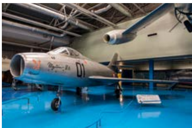
Dassault Mystère IV A-01 , the first French fighter to break the sound barrier

Spanning several eras, the hall gives pride of place to helicopters and gyrocopters, which became familiar sights in the civil and military aviation landscape. Visitors will enjoy admiring a whole host of strange machines attesting to human ingenuity: from Oehmichen's helicostat no.6, dating from 1935, to the Cierva C8-2 – the first autogiro to have crossed the Channel – to the Alouette III of the high-mountain rescue squad of the French Gendarmerie, which saved countless lives.