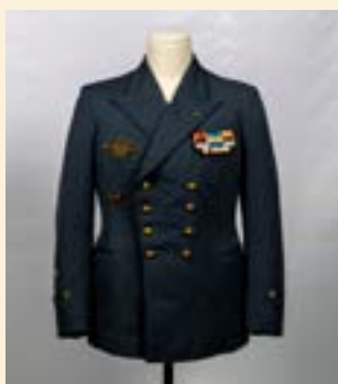
Inspector vest uniform from 1970