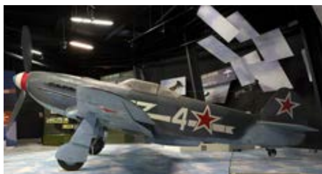
Yakovlev Yak-3 , the last existing original aircraft of the Normandie Niemen Group