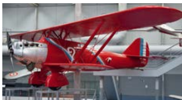
Bréguet XIX TF Super Bidon Point d'Interrogation , the first aircraft to fly east-west from Paris to New York