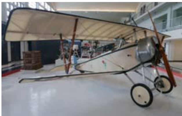
Nieuport Type XI bébé , an aircraft emblematic of the World War I fighters