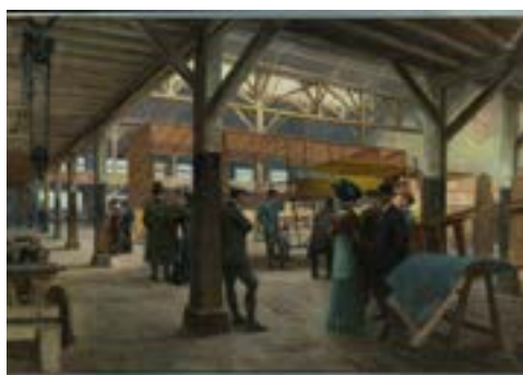
Oil on canvas Voisin brother's workshop in Billancourt , François Alaux, 1908, a painting depicting aviation's Belle Époque