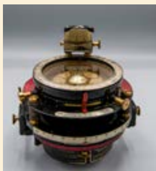
Navigation compass for Le Bourget-Omsk raid in 1926

The scenography designed by SNOOPP reinvests the space by using the unique history of the control tower. The natural light offered by the large windows and the tarmac view certainly made this exposition different for the public.