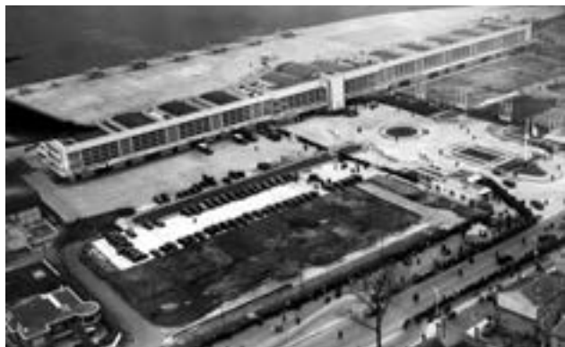
Le Bourget in 1937

To cater to the growth in traffic, between 1920 and 1924 five enormous hangars were built alongside the runways as the first airport-style facilities, heralding the future airport. The adventurous passengers of the first commercial flights flocked to Le Bourget Airport to try out this new means of transport which, though risky and an uncomfortable ride, was so thrilling and modern!