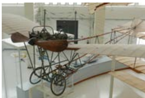
Santos-Dumont Demoiselle , one of the first mass-produced airplanes