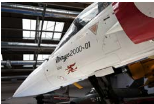
Dassault Mirage 2000-01 , prototype of one of the current French Air and Space Force aircraft

Visitors can continue their discovery of military aviation with the displays of aircraft that the French Air Force has used from the 1950s until today. One of the star exhibits is a Mirage 2000 (Dassault), a multirole fighter jet that equipped the French Army from 1984.