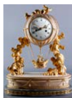
Charles and Robert Balloon “Charlière” clock , an example of “balloon mania” at the end of the 18 th century