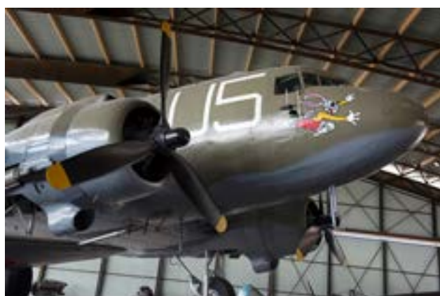
Douglas C-47 Skytrain , one of the most produced aircraft in