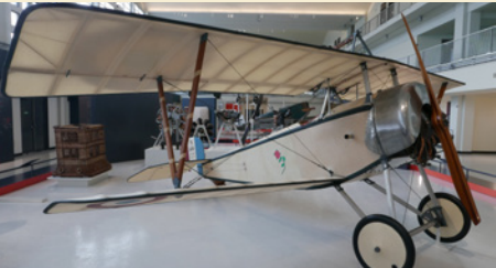
Grande Galerie / Great War Hall An aircraft emblematic of the World War I fighters