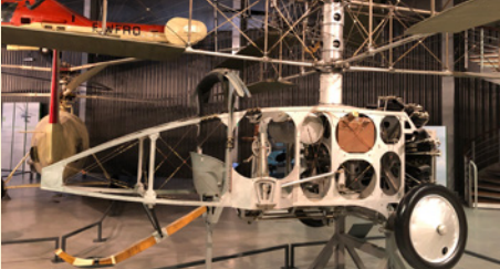
Helicopter Hall The beginnings of the helicopter