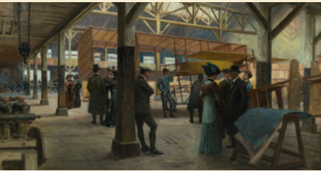
Grande Galerie / Pioneers Hall A painting depicting aviation’s Belle Époque

4 OIL ON CANVAS: VOISIN BROTHERS’ WORKSHOP IN BILLANCOURT