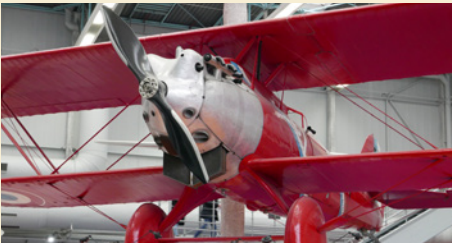
Interwar Hall The first aircraft to fly east-west from Paris to New York

6 BRÉGUET XIX TF SUPER BIDON POINT D’INTERROGATION