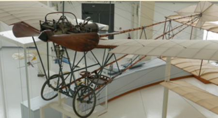
Grande Galerie / Pioneers Hall One of the first mass-produced airplanes

4 OIL ON CANVAS: VOISIN BROTHERS’ WORKSHOP IN BILLANCOURT