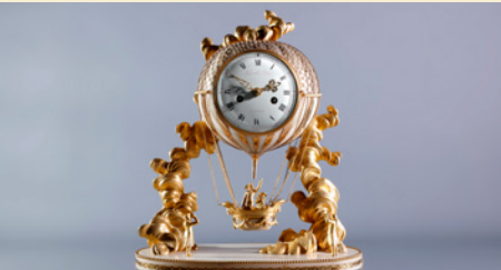
Grande Galerie / Pioneers Hall An example of “balloon mania” at the end of the 18 th century

1 CLOCK: CHARLES AND ROBERT’S BALLOON, KNOWN AS “CHARLIÈRE”