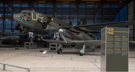
World War II Hall One of the most produced aircraft in history