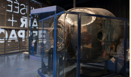
Space Hall A genuine spaceship and one of the few objects to return from space