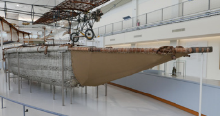
Grande Galerie / Pioneers Hall A 19 th century arm-powered airship basket