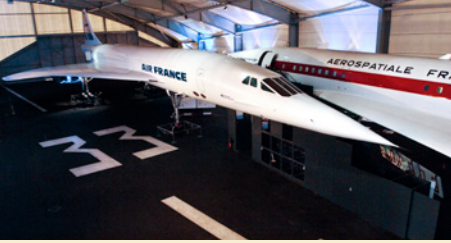
Concorde Hall The 001 prototype of the legendary supersonic airliner and the record-breaking Concorde Sierra Delta