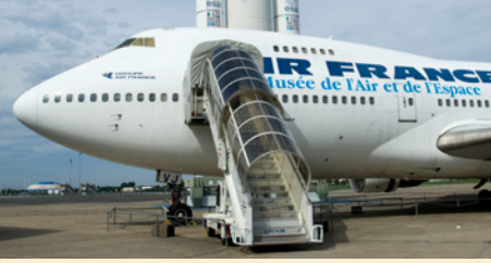
Tarmac The Jumbo Jet, the aircraft that revolutionised air transport