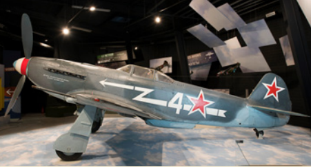
Normandie-Niemen Hall The last existing original aircraft of the Normandie-Niemen Fighter Group