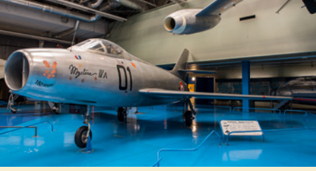
Prototype Hall The first French fighter to break the sound barrier