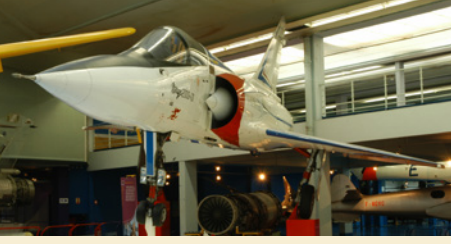
Cocarde Hall, French military aviation The prototype of one of the current French Air and Space Force aircraft