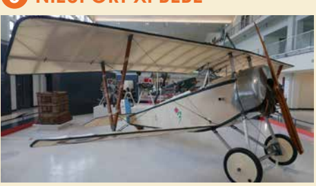
Grande Galerie / Great War Hall An aircraft emblematic of the World War I fighters