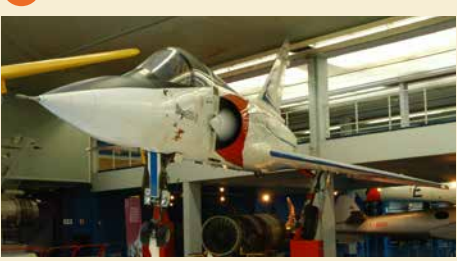
Cocarde Hall, French military aviation The prototype of one of the current French Air and Space Force aircraft