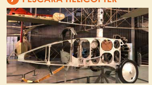
Helicopter Hall The beginnings of the helicopter