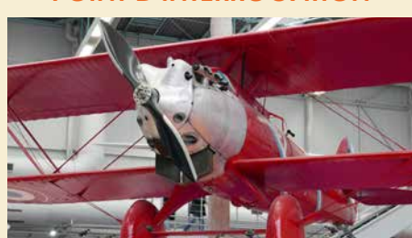
Interwar Hall The first aircraft to fly east-west from Paris to New York