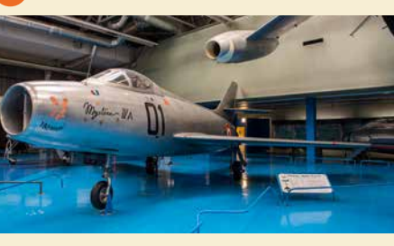
Prototype Hall The first French fighter to break the sound barrier